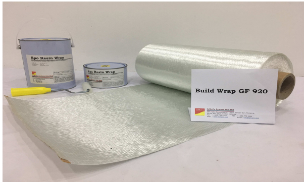
Build Wrap GF, Standard Tensile Strength & Tensile Modulus, Glass Fiber [Wrap] Roll Size

Strengthening System for Buildings & Bridges Structures or Timber Woods