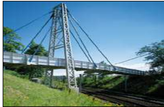
Build Wrap GF [Glass Wrap] with Build Strength CF [Carbon Fiber H Beam & Other Profiles], Are install for Bridges Span, since 1992

GLASS FIBER Build Wrap GF® is a fabric sheet of longitudinal oriented, continuous glass fiber filaments which are held in position by a lightweight, open mesh, glass scrim. Build Wrap GF® has robust handling and rapid wet-out characteristics which make it ideal for on-site strengthening of structural of buildings, bridges, beams, columns and marine structures. Additionally, Build Wrap GF® is compatible with all commonly used resin systems which can be applied using a variety of wet-out/resin infusion techniques.